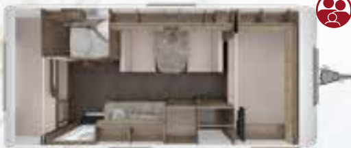
ROSSINI 490 DM 2,3