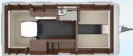
PUCCINI 550 E 2,5