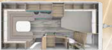
PEP 490 TD 2,3