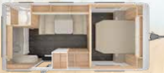
VIVALDI 550 DF 2,5