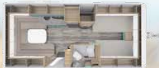
PEP 540 E 2,3