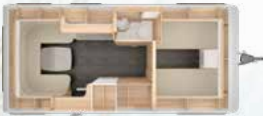
VIVALDI 550 E 2,5