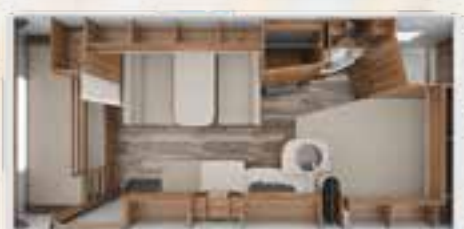
DA VINCI 540 DM 2,5