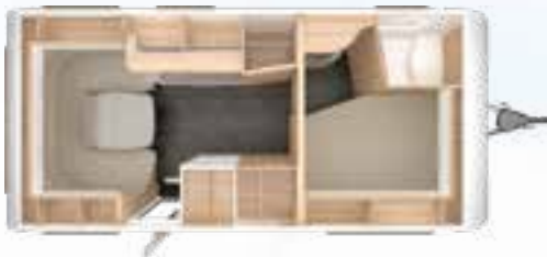
VIVALDI 490 TD 2,3