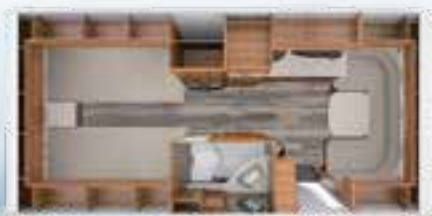
DA VINCI 495 HE 2,3