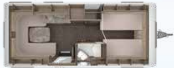
ROSSINI 540 E 2,3