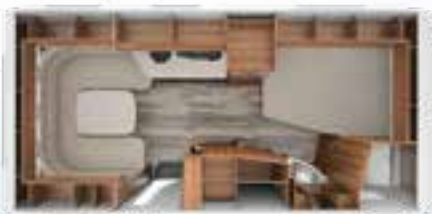
DA VINCI 490 TD 2,3