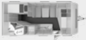
SÜDWIND 500 QDK