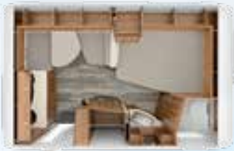
DA VINCI 380 TD 2,3