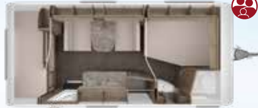
ROSSINI 520 DM