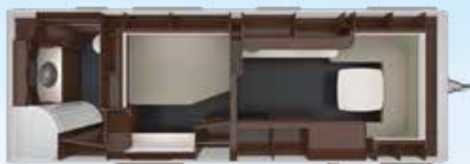
PUCCINI 750 HTD 2,5