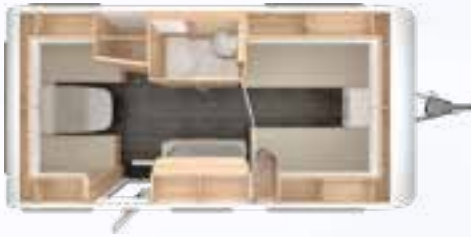
VIVALDI 460 E 2,3