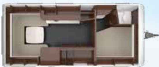
PUCCINI 560 TD 2,5