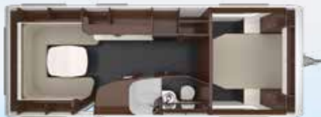
PUCCINI 685 DF 2,5