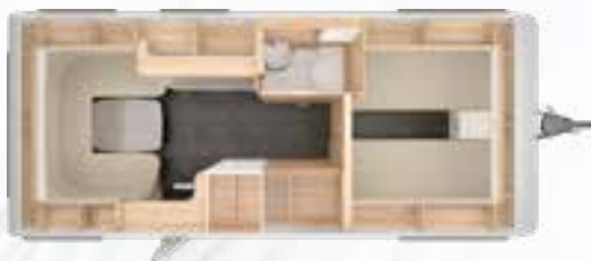
VIVALDI 550 E 2,3