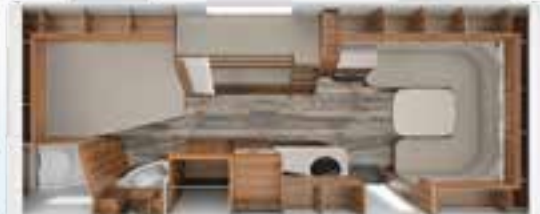
DA VINCI 655 KD 2,5