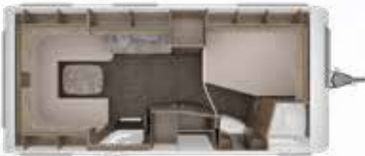
ROSSINI 490 TD 2,3