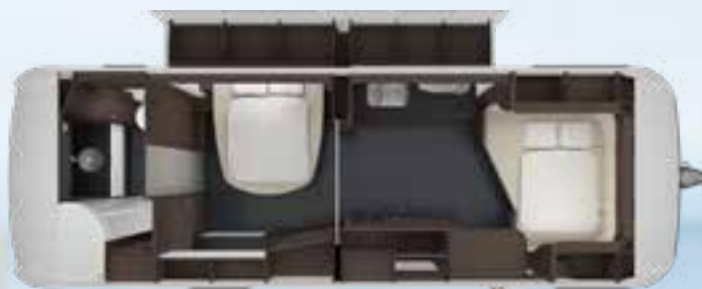
CELLINI 750 HTD 2,5 SLIDE OUT