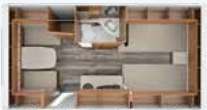
DA VINCI 460 E 2,3