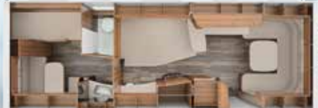
DA VINCI 700 KD 2,5