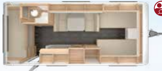
VIVALDI 560 EMK 2,5