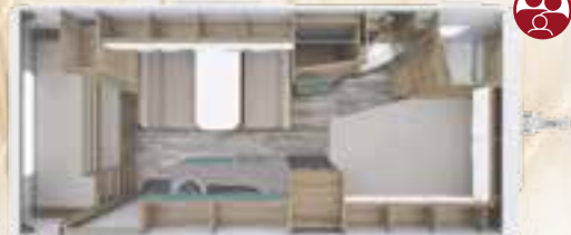
PEP 550 DM 2,3