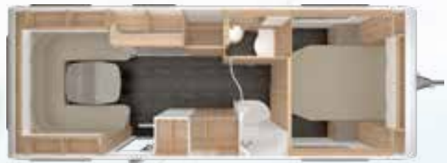
VIVALDI 685 DF 2,5