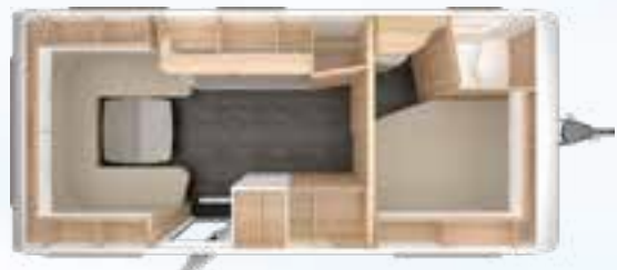
VIVALDI 560 TD 2,5