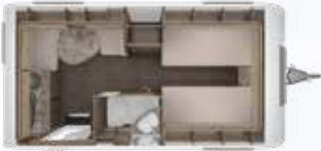
ROSSINI 450 E 2,3