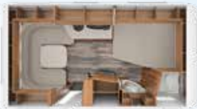
DA VINCI 450 TD 2,3