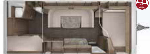
ROSSINI 620 DM 2,5