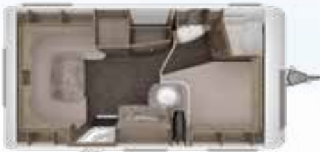
ROSSINI 450 TD 2,3