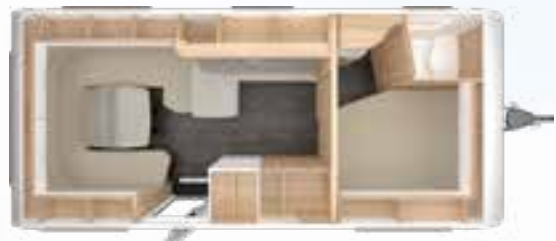
VIVALDI 560 TDL 2,5