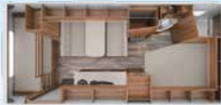
DA VINCI 550 DM 2,3