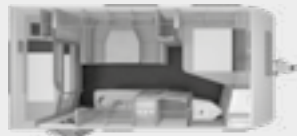
SÜDWIND 550 FSK