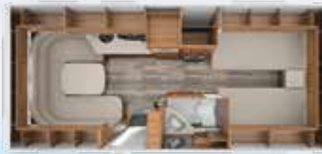
DA VINCI 540 E 2,3