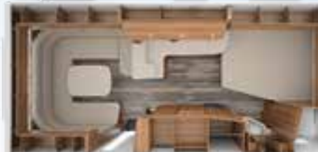
DA VINCI 560 TDL 2,5