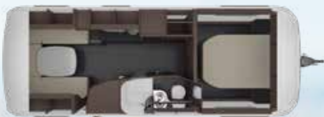
CELLINI 655 DF 2,5